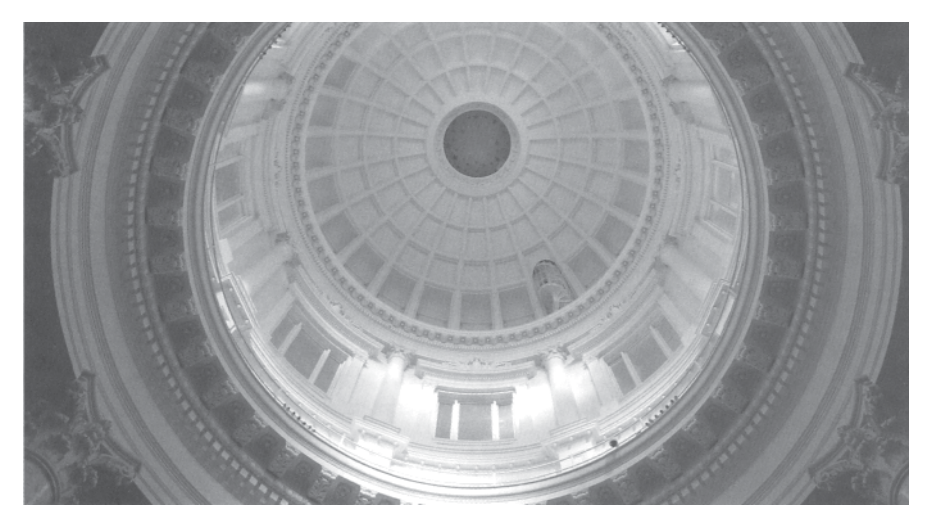
· Capitol Dome Interior

The building of red brick in the Norman style of architecture was finally completed in 1886. It measured 123' \times 81' with five floors including the basement, but it had no indoor plumbing. It was used from 1886 to 1912