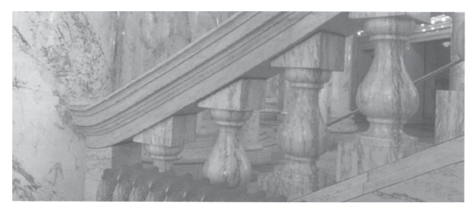
Capitol Interior Stairway

For additional information on the restoration of the State Capitol: http://www.idahocapitolcommission.org/