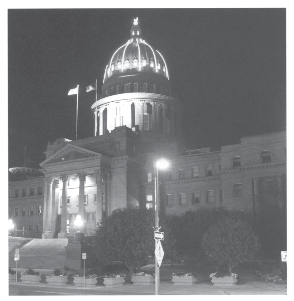
Capitol at Night