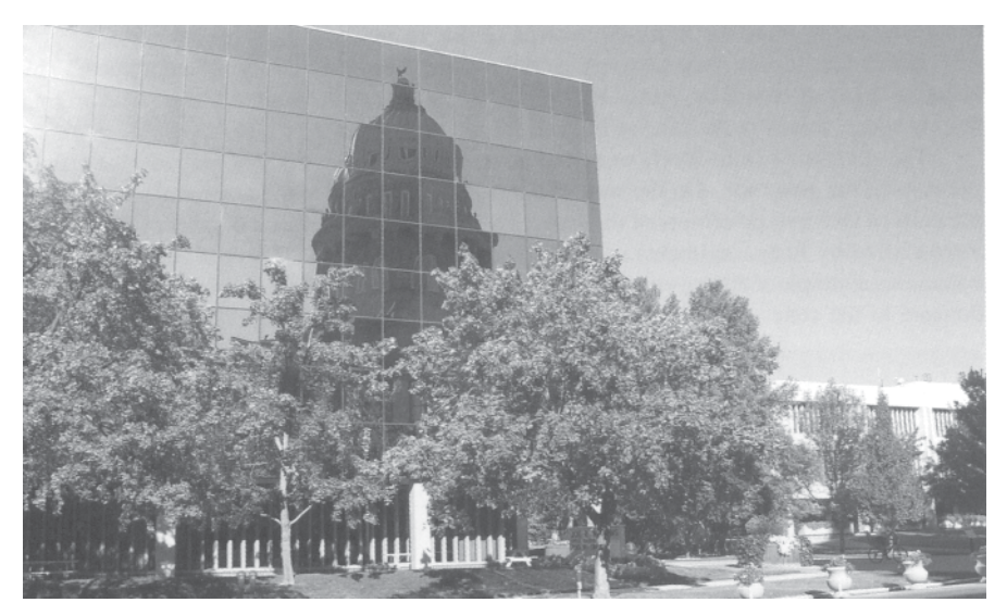
Capitol Reflection in Joe R. Williams Building

is 208 feet high. The original plans called for a flag atop the dome, but in the course of construction the eagle was substituted. The outside walls are faced with sandstone from state owned Tablerock east of Boise. Convict labor was used to quarry and deliver the sandstone blocks, some weighing up to ten tons. The shape of the sandstone blocks on the first floor resembles logs and gives the lower part of the building the appearance of a log cabin.