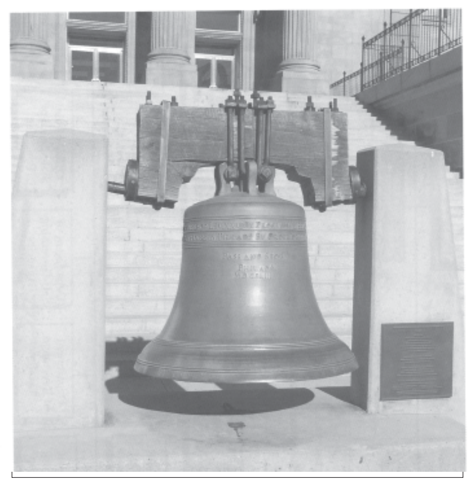
Liberty Bell at Capitol Steps