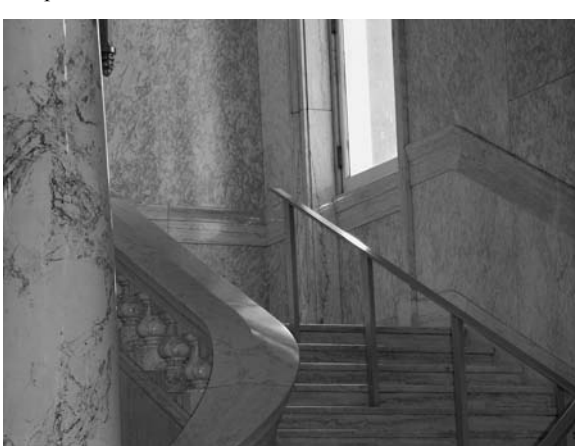
Capitol Interior Stairway

Despite the delay of the entire project, the Commission was able to see that the exterior envelope of the structure was preserved and restored to protect any further deterioration to the interior structure. Between 2001 and 2002 about $1.5 million was appropriated for Phase I Exterior Renovation. The following year the Legislature appropriated nearly $3 million to complete Phase II Exterior Renovation. All exterior work was completed Spring of 2006.