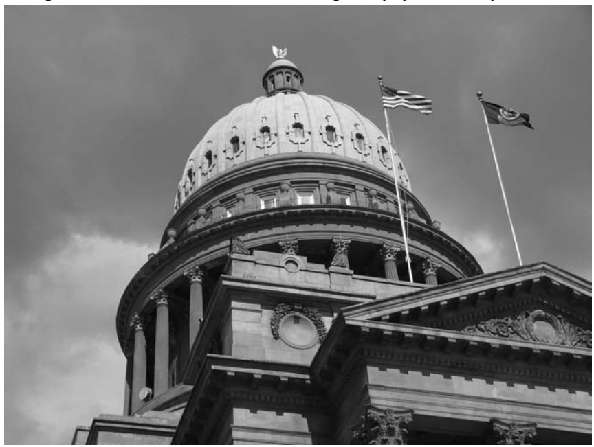
Capitol Dome Exterior

Construction of the present building was begun in 1905. The original phase included only the central section and dome. The architectural design was supplied by J.E. Tourtellotte and Company. It is in the standard neoclassic style, patterned after the U.S. Capitol. Construction of the central section and dome was completed in 1912. Tourtellotte and Hummel were awarded a contract in 1912 to design wings for the building and construction began in 1919. The Central School building was demolished to make way for the west wing and the Territorial Capitol building was razed for construction of the east wing. The project was completed in 1920.