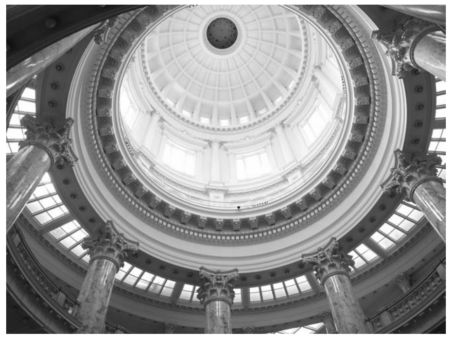
Capitol Dome Interior

The corridors, floors, wainscoting and base throughout the building consist of 50,646 square feet of artistically carved marble. There are four kinds blended into the interior: green swirled Vermont marble on the walls, gray Alaska marble with inlaid patterns of near black Italian marble in the floors and four grand staircases, and reddish pink Georgia marble in the trim.