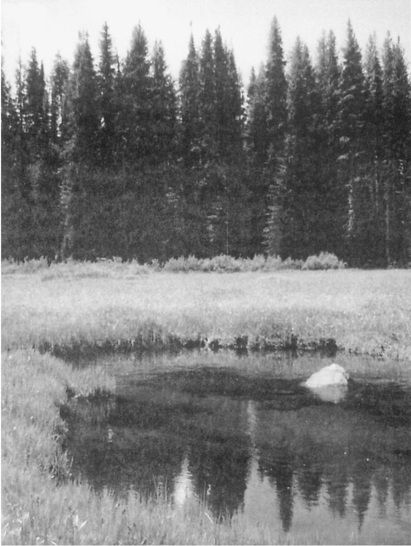
Glade Creek near Lolo Pass