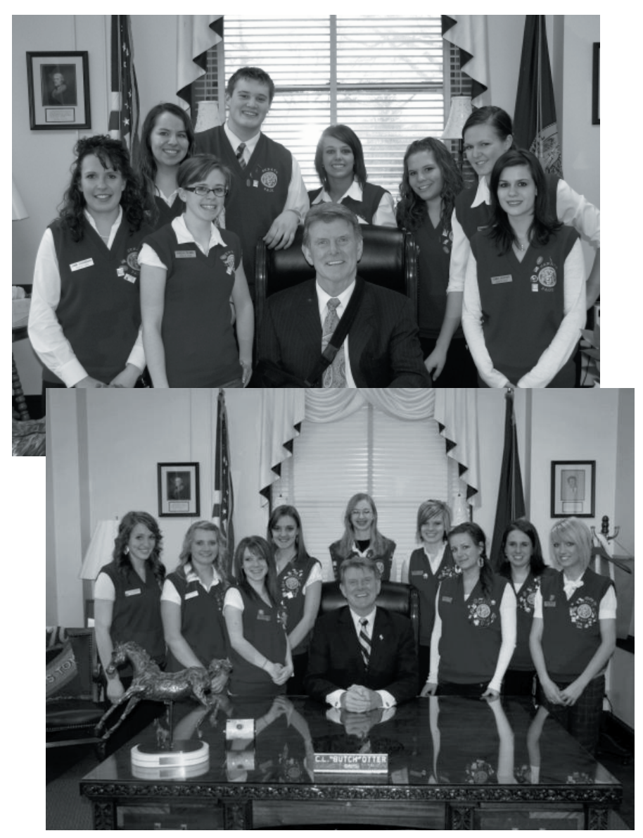
2009 Senate Pages with Governor C.L. 'Butch' Otter.