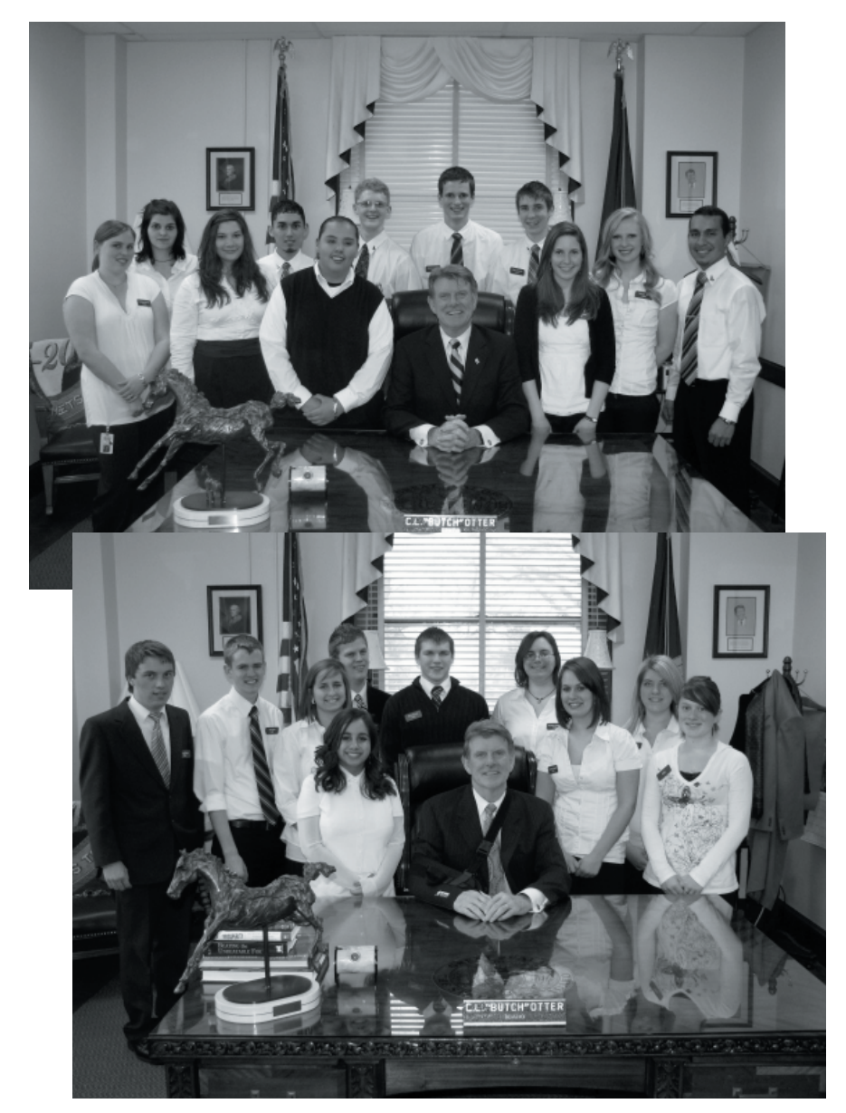
2009 House Pages with Governor C.L. 'Butch' Otter.