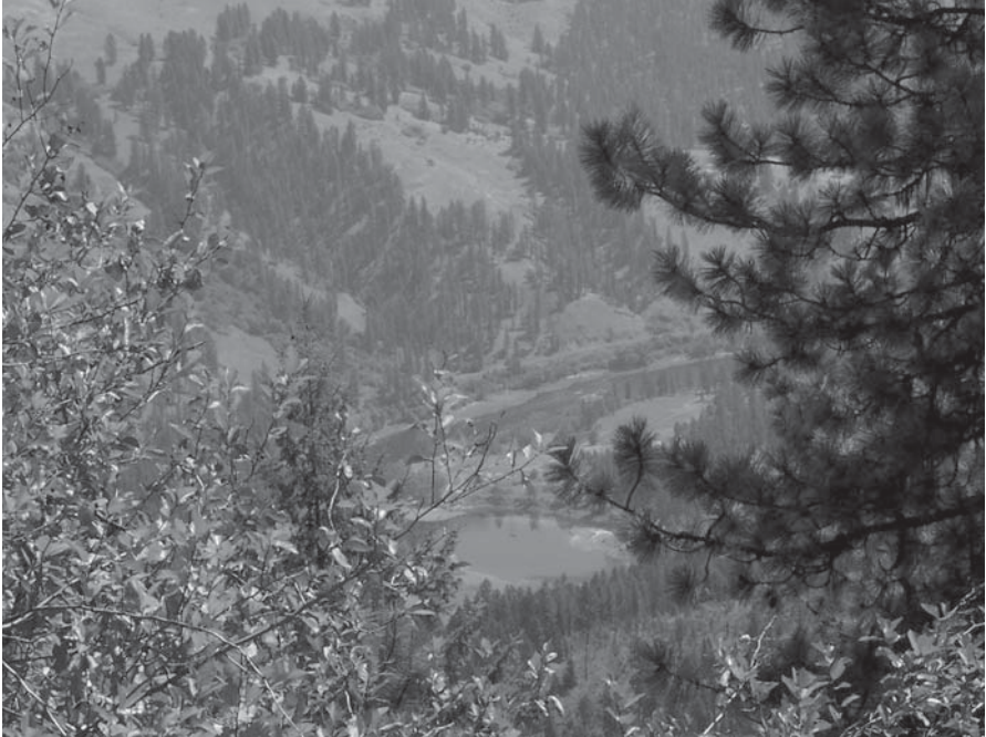
Gilbert Grade near Orofino, overlooking the Clearwater River.