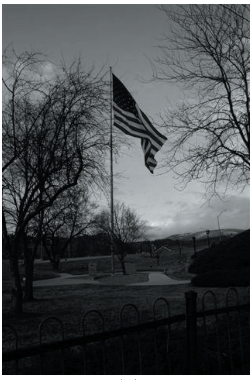
Veterans Memorial Park, Bonners Ferry