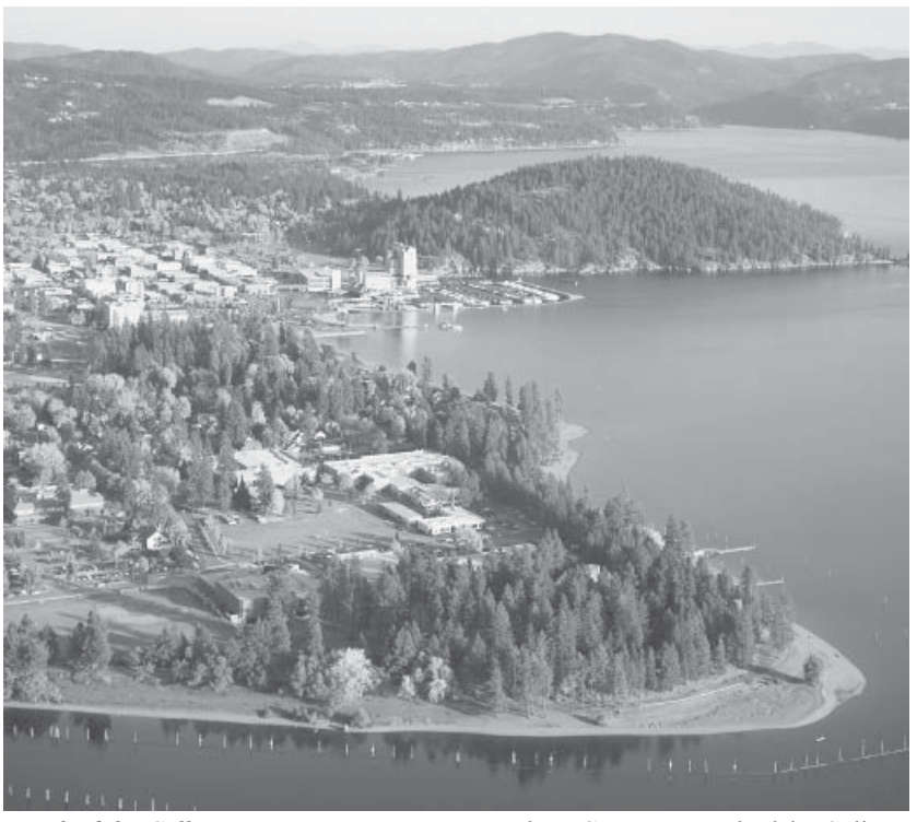
North Idaho College

American Council on Education, Council for the Advancement and Support of Education, University Continuing Education Association, and American Association of Colleges of Teacher Education.