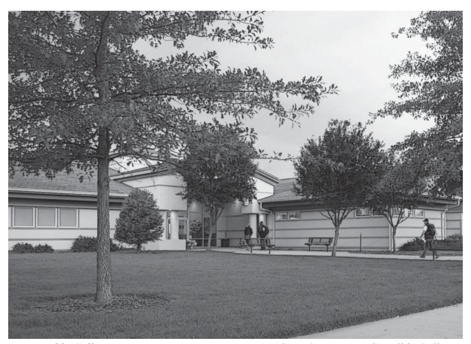
Boise Bible College

BBC began in 1945 as a ministry of the First Church of Christ in Boise as a training school for ministers in the Pacific Northwest. In 1974, the college became an independent institution and moved to the current campus in west Boise. In 1989 BBC received accreditation through the ABHE (Association for Biblical Higher Education, 5575 S. Semoran Blvd. Ste. 26, Orlando FL 32822-1781). Since 1990 BBC has expanded programs, built new campus facilities, and