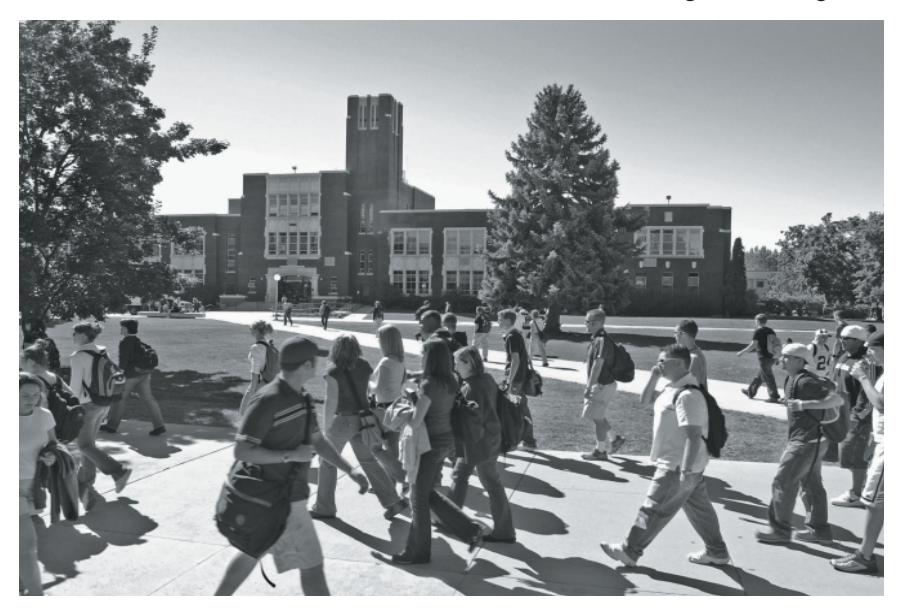
Boise State University

Boise State scientists are engaged in world-class studies both on campus and around the world. Areas of expertise include materials science, subsurface sensors, wind energy and health-related research on cancer and Alzheimer's disease. Undergraduate and graduate