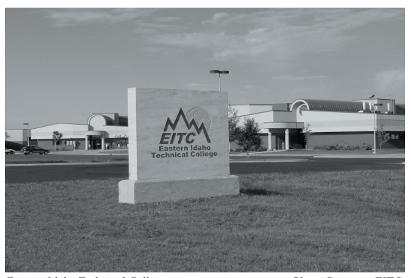
Eastern Idaho Technical College

The CSI Honors and Phi Theta Kappa programs are attractive to all students who want to enhance their college resumes with high-achievement offerings leadership opportunities. Idaho's New Century Scholar, an academic honor awarded to one community college student from each state, has been a CSI student for each of the last three years. The University of Idaho,