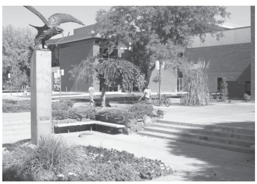
College of Southern Idaho

Degrees Granted: Associate and Certificate