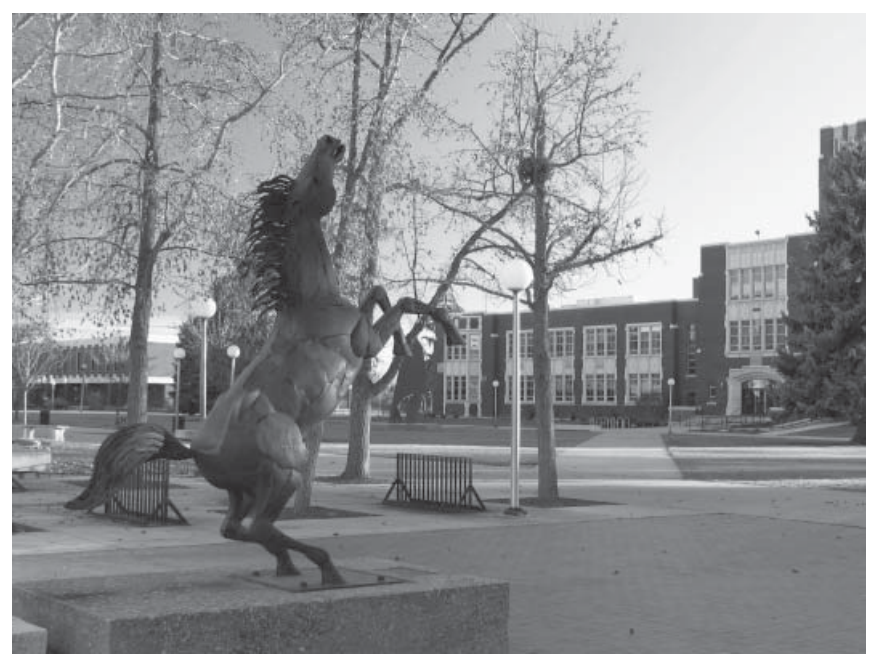
Boise State University Campus