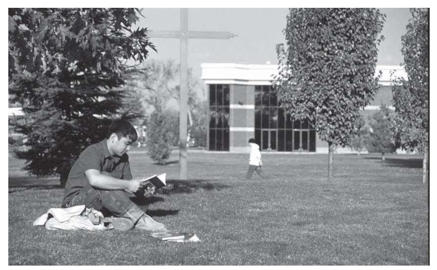
Northwest Nazarene University