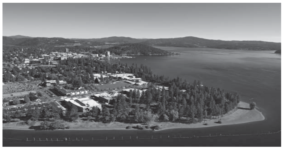
North Idaho College