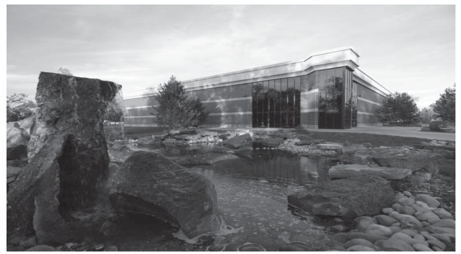
Northwest Nazarene University

Located on a beautiful campus, C of I offers a wide range of activities to students and the community, including 13 men's and women's athletics teams and a vibrant performing arts program. The College also reflects the world, with students from more than 40 countries making up 9 percent of its student body.