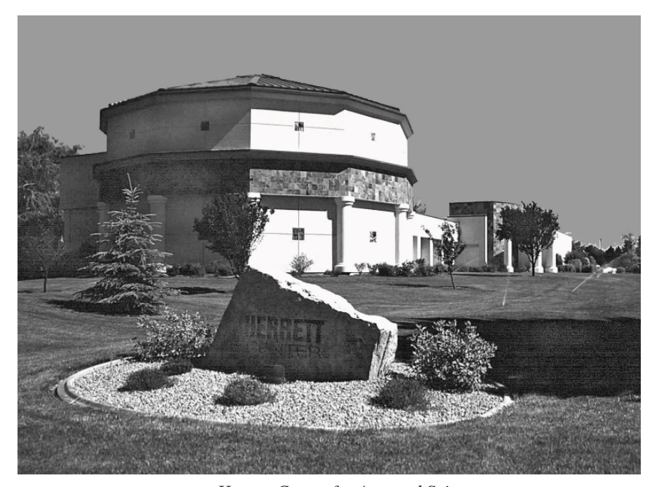
Herrett Center for Arts and Science

The Herrett Center for Arts and Science is a non-profit museum on the main campus of the College of Southern Idaho in Twin Falls. Its purpose is primarily educational, offering programs to elementary and secondary school students, CSI students, and the adult community of south-central Idaho. The Center collects, preserves, interprets, and exhibits anthropological artifacts and natural history specimens with an emphasis on the prehistoric American continents.