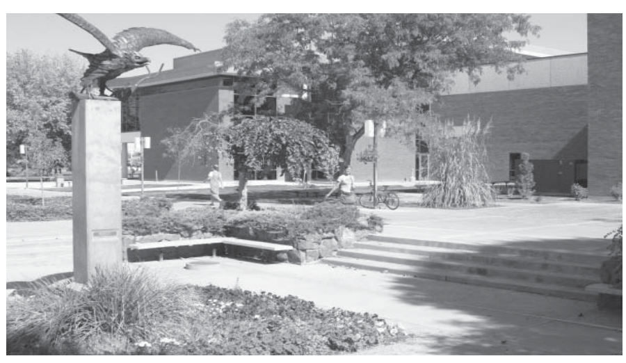
College of Southern Idaho

Degrees Granted: Associate and Certificate