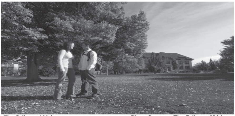
The College of Idaho

The BYU–Idaho campus includes about 40 major buildings and residence halls on over 400 acres. Since the transition from Ricks College, new buildings have been constructed and others have been renovated or expanded. Construction is underway on a 15,000-seat auditorium, as well as an expansion and remodel of the Hyrum Manwaring Student Center. Both are scheduled for completion in 2010.