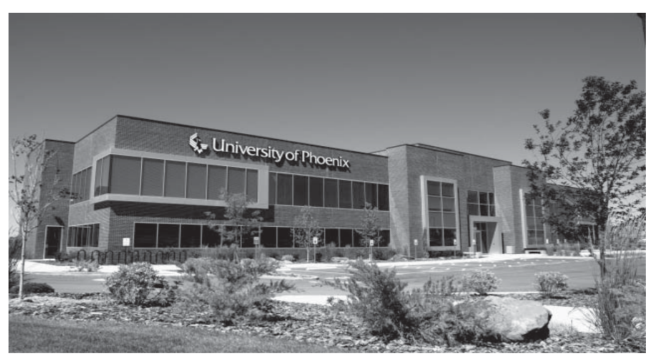
University of Phoenix

Along with its educational offerings, NNU offers seminars, concerts and lectures to the community, often free of charge. NNU's Brandt Center is a beautiful, 1500-seat auditorium that regularly hosts the Boise Philharmonic and other concerts and events.