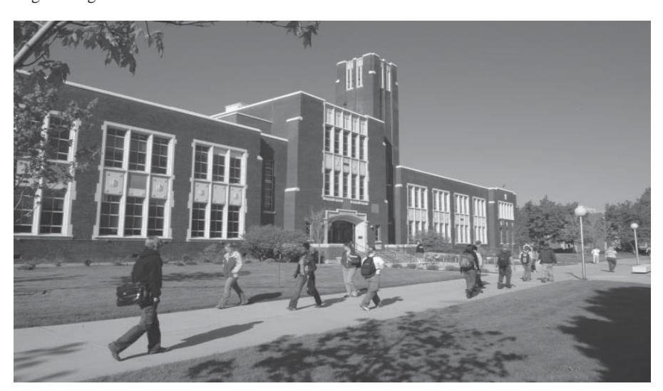
Boise State University

Boise State scientists are engaged in world-class studies both on campus and around the world. Areas of expertise include materials science, subsurface sensors, wind energy and health-related research on cancer and Alzheimer's disease. Undergraduate and graduate students work with faculty on cutting-edge research initiatives. This hands-on experience both enhances and expands students' education and prepares them for future careers in medicine, engineering and the sciences.