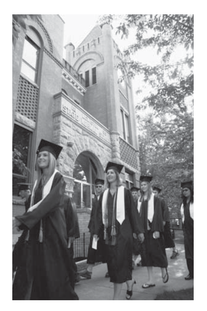
Lewis-Clark State College

Lewis-Clark State College is a regional undergraduate institution offering baccalaureate degrees in education, nursing, business, social work, criminal justice, as well as in the liberal arts and sciences. The college has a wide variety of professional-technical programs leading to certificates, associate's degrees and bachelor's degrees in applied technology. The college also offers several programs for individuals with other educational goals, including a large GED program.