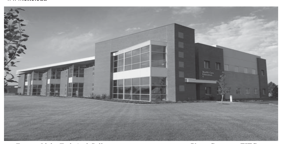
Eastern Idaho Technical College