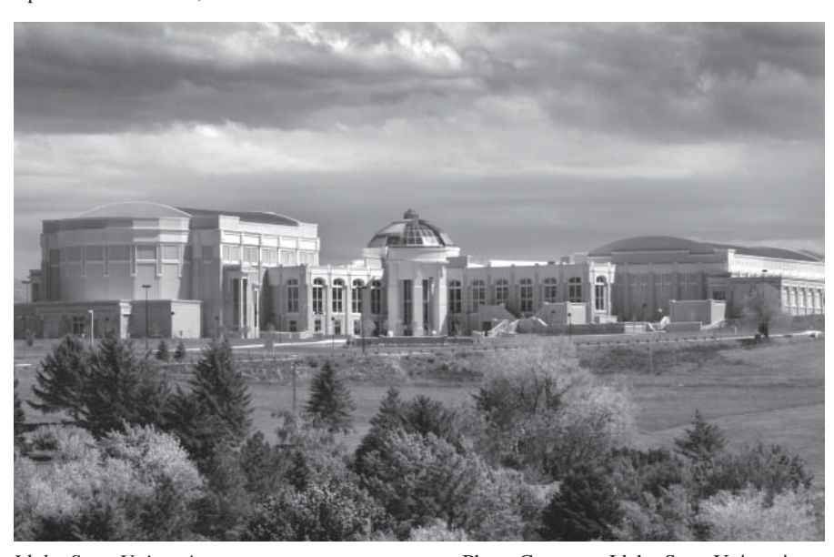
Idaho State University