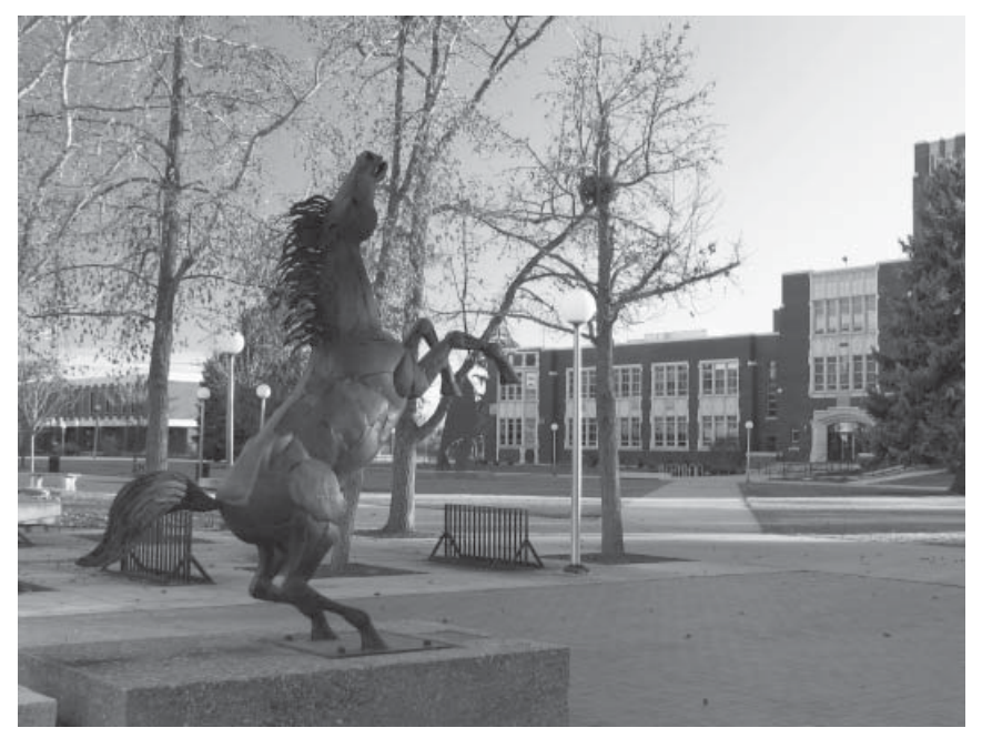
Boise State University Campus