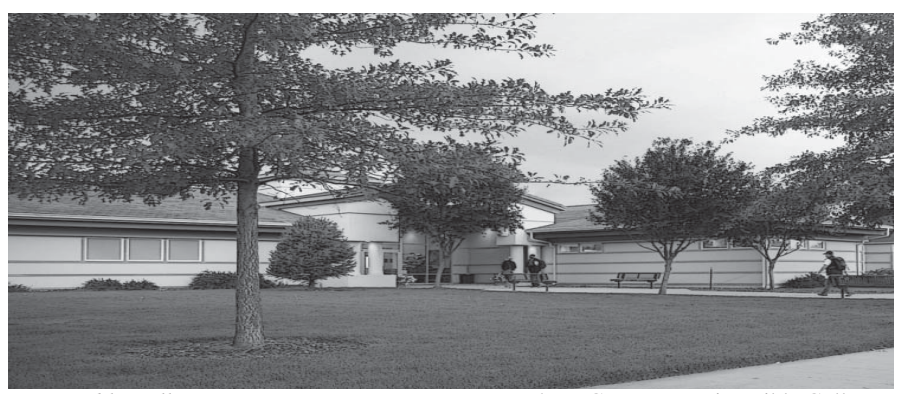
Boise Bible College

BBC began in 1945 as a ministry of the First Church of Christ in Boise as a training school for ministers in the Pacific Northwest. In 1974, the college became an independent institution and moved to the current campus in west Boise. In 1989 BBC received accreditation through the ABHE (Association for Biblical Higher Education, 5575 S. Semoran Blvd. Ste. 26, Orlando FL 32822-1781). Since 1990 BBC has expanded programs, built new campus facilities, and dramatically increased enrollment. After more than 60 years, the purpose of BBC remains to prepare leadership for the Lord's church in America and throughout the world. BBC is nondenominational, but supported mostly by independent Christian churches and Churches of Christ. Most students are from the Pacific Northwest and Intermountain West.