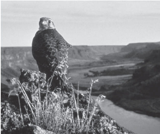
Golden Eagle above Snake River