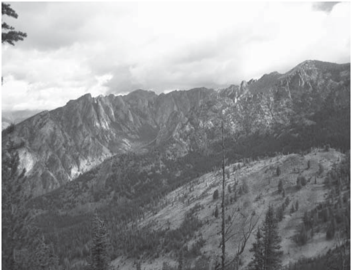
Near Ship Island