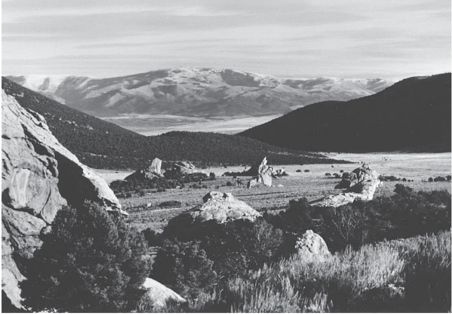
Silent City of Rocks