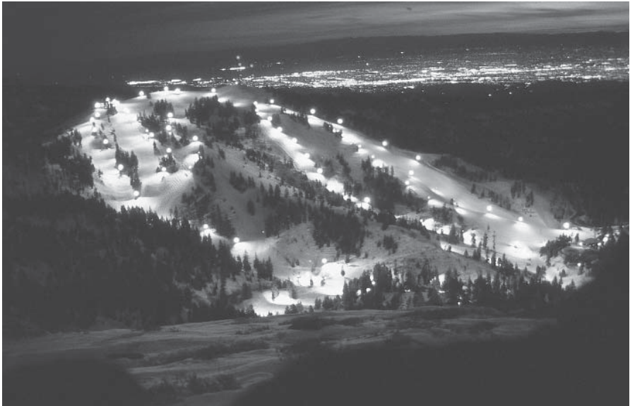
Aerial view of Bogus Basin Resort lit for night skiing.

Phone: (208) 332-5100; Toll Free: 800-367-4397; www.bogusbasin.org