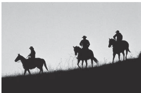
Horseback Riders in the Boise Foothills