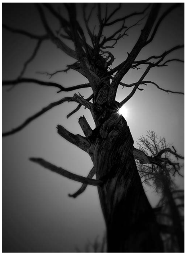
Tree at Big Lost Lake