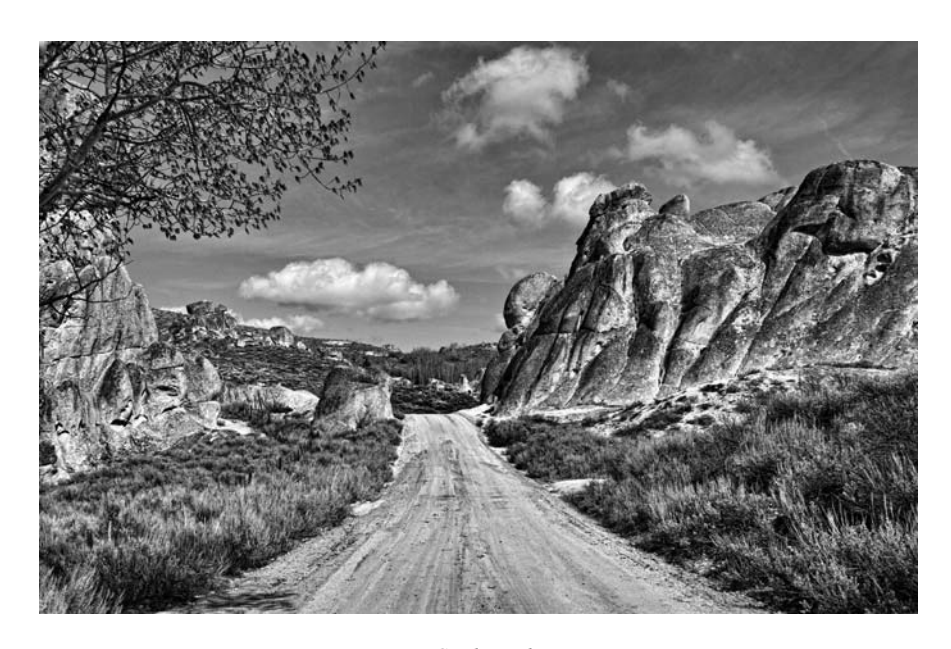
Castle Rock