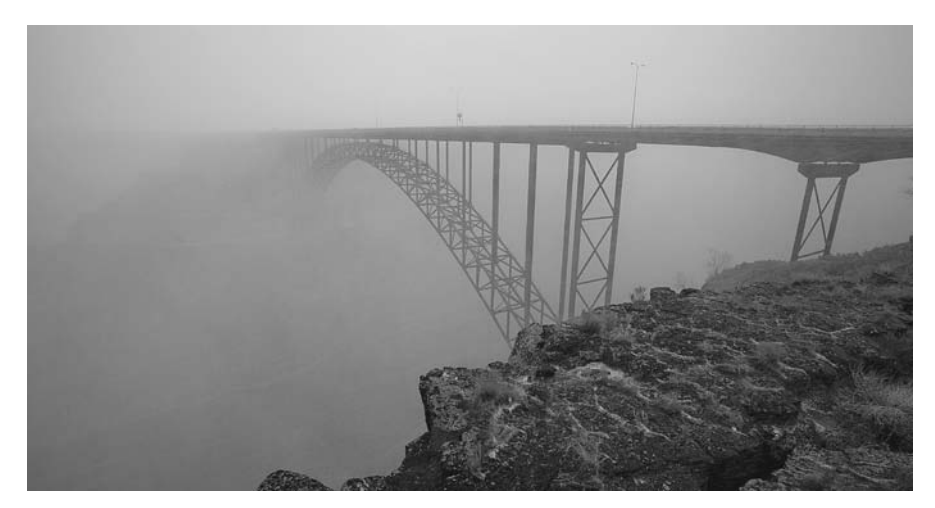
The Perrine Bridge during a snow storm in April of 2013