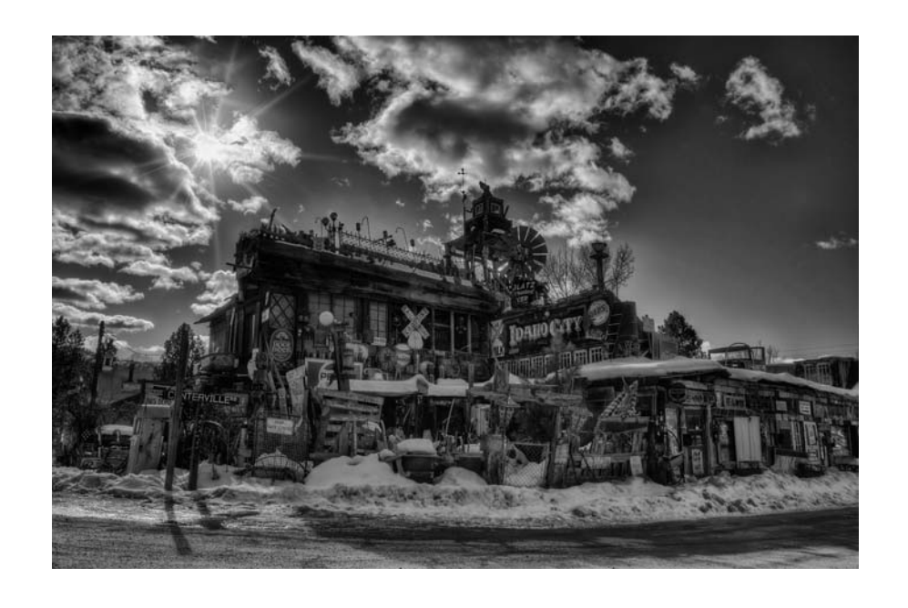
In Idaho City