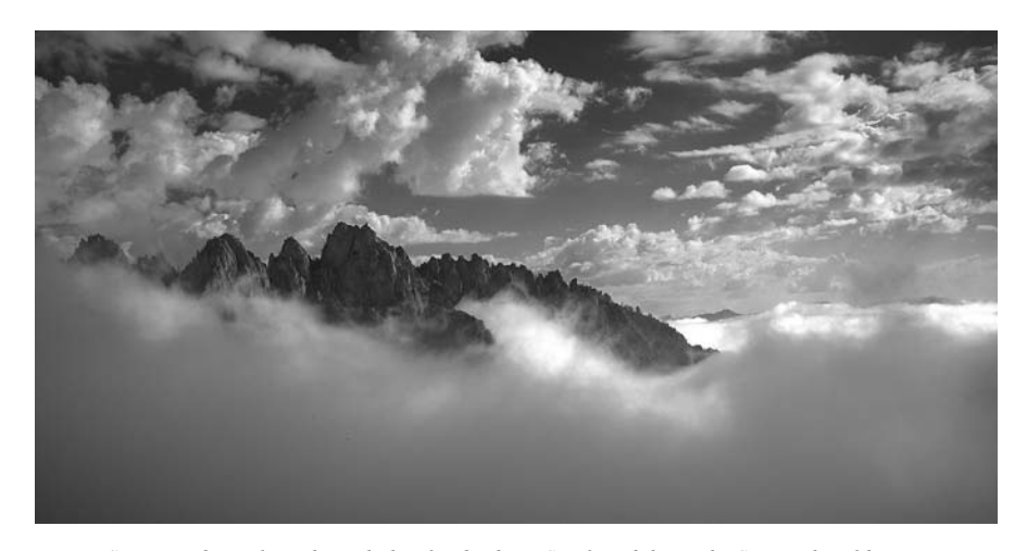
Serrate ridge poking through the clouds above Stanley Idaho in the Sawtooth Wilderness