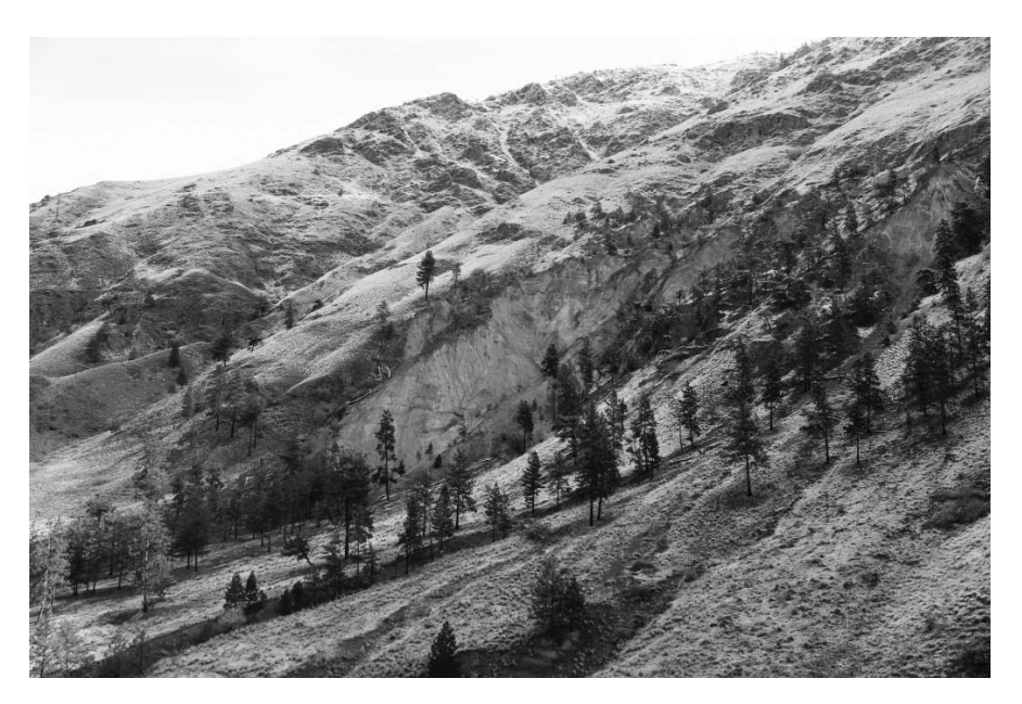
Hells Canyon