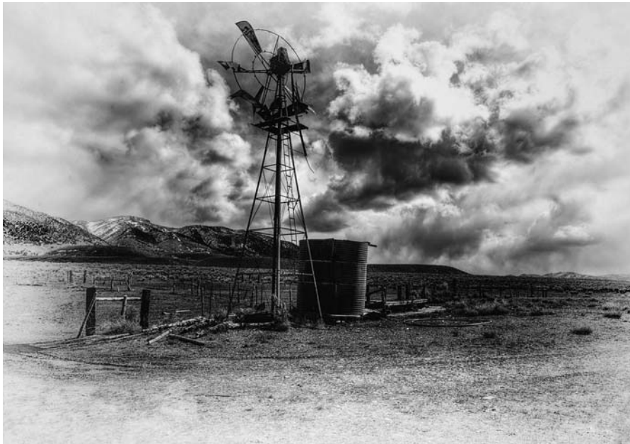
Top: Wilson Ponds Bottom: Old Windmill