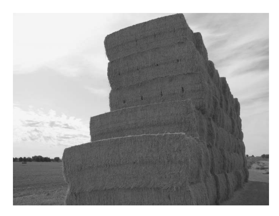
Near New Plymouth