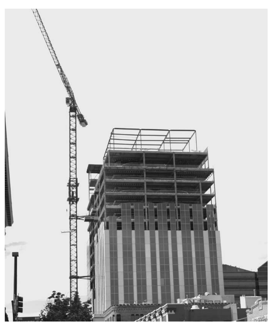
In 2012, work finally began on Boise's famous downtown eyesore, the Boise Hole. Before it became the Boise Hole, the location was home to the Eastman Building, which occupied the corner for 82 years. On January 24, 1987, fire destroyed the building.

The building is planned to be finished in 2014. Zion's Bank plans to open an Idaho headquarters in the building, with other tenants signed on to open when the ribbon is cut.