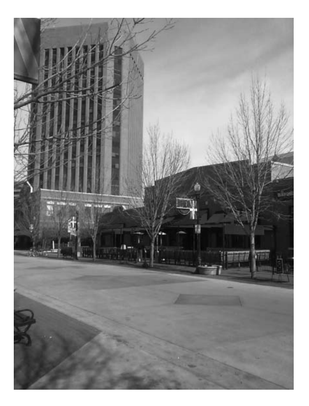
Basque Block, Downtown Boise Photo Courtesy: Roy V. Cuellar

Source: Idaho Fiscal Facts 2012, Legislative Services Office