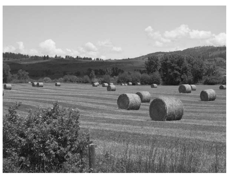
Adams County near Council

Source: U.S. Bureau of the Census, Survey on Processing and Products Branch