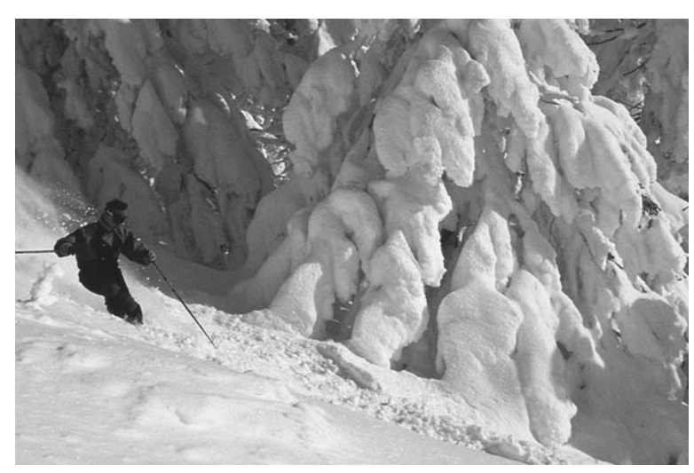
Skiier at Bogus Basin