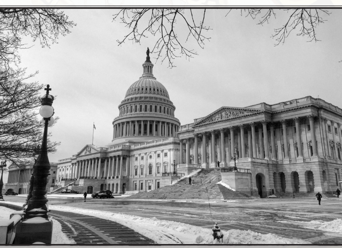
US Capitol Building