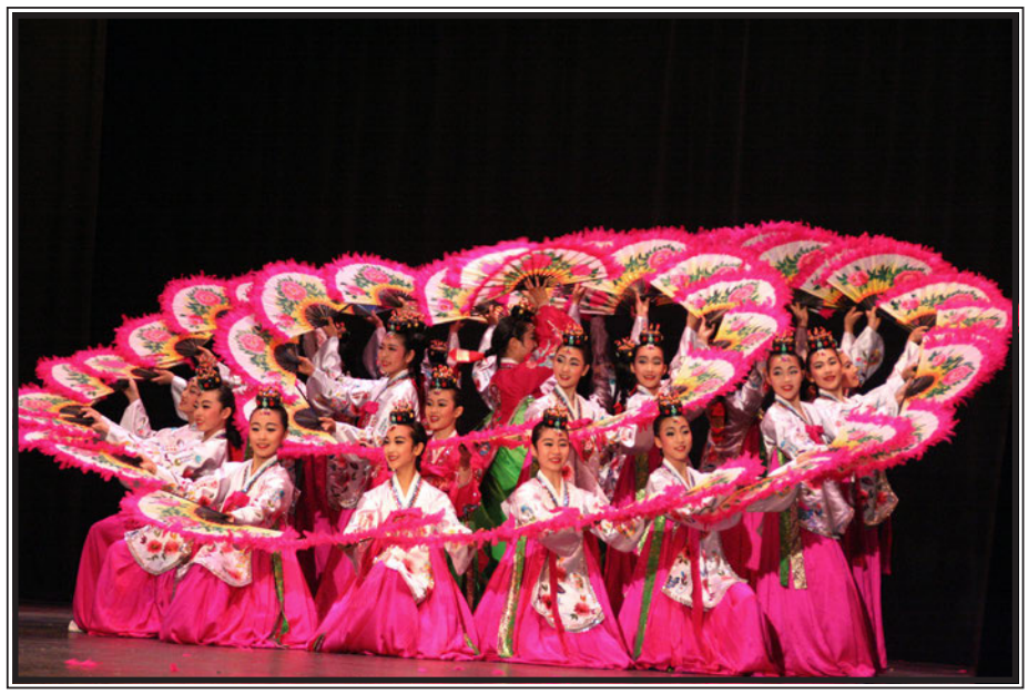
Idaho International Dance Festival