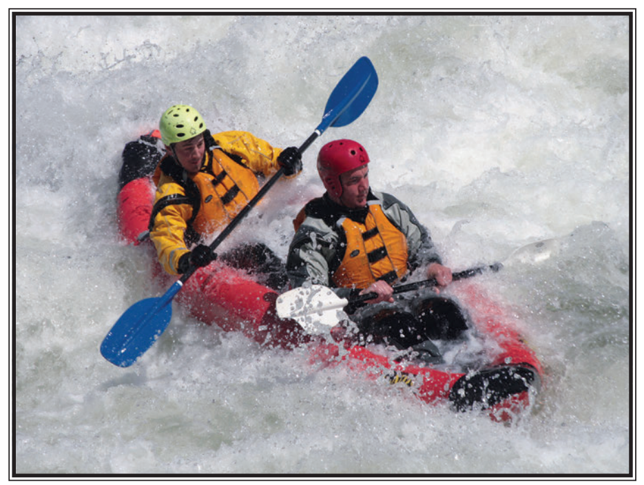
Kayaking the Lochsa River