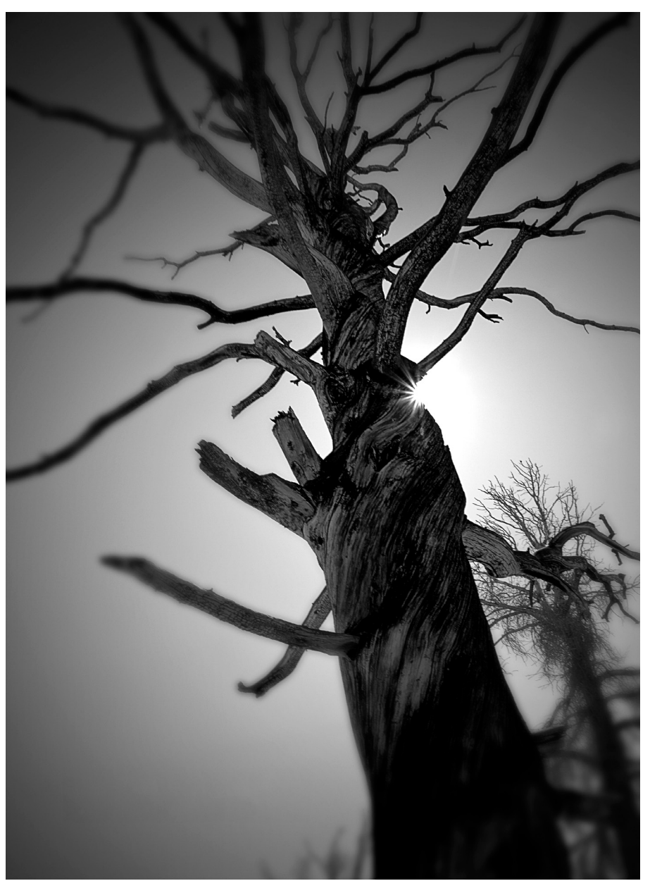
Big Lost Lake

limited taxing powers but are required to certify their requirements to the county commissioners who must include these needs in the collections made by county tax collectors.