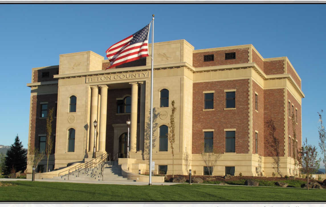
Teton County Courthouse