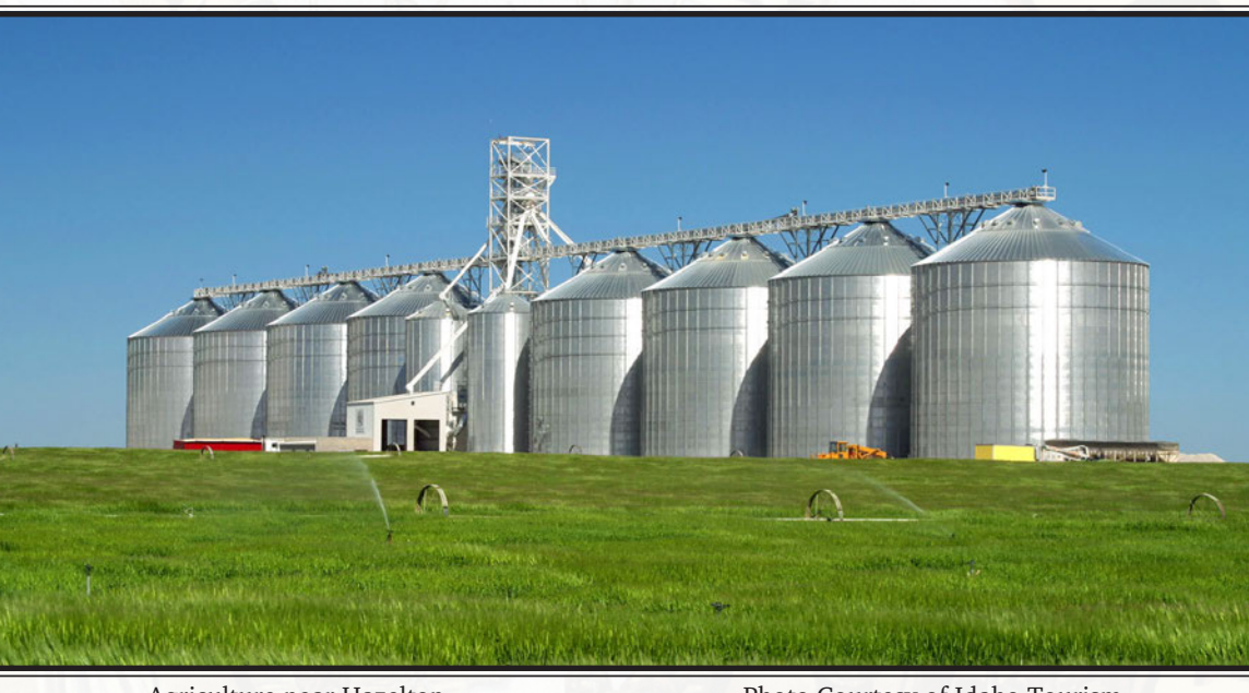
Agriculture near Hazelton