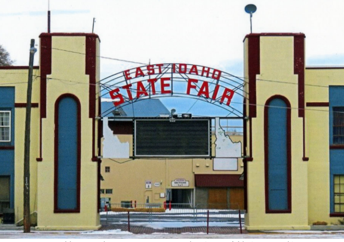
Eastern Idaho Fairgrounds