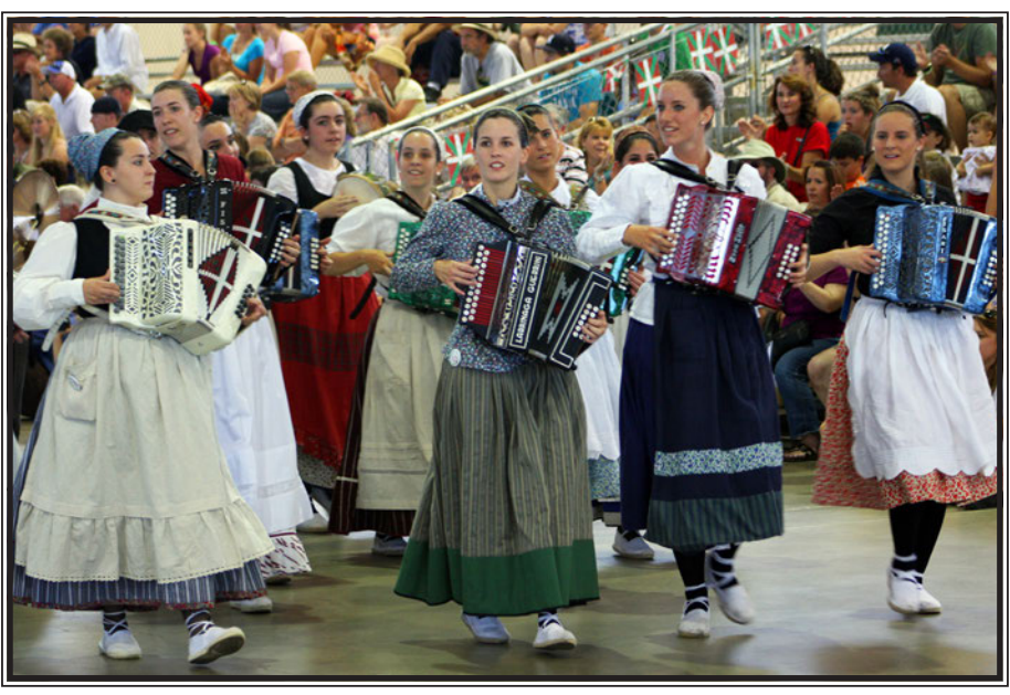
Basque Musicians at Jaialdi