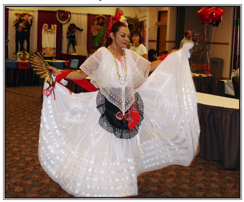
Idaho Latin Expo