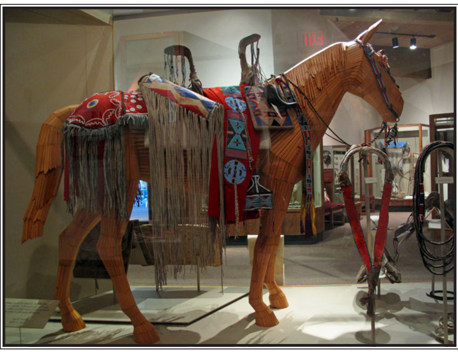
Artifacts, Nez Perce National Historical Park

Nez Perce Tribal Executive Committee PO Box 305 Lapwai ID 83540 208-843-2253 www.nezperce.org Narrative courtesy of The Nez Perce Tribe