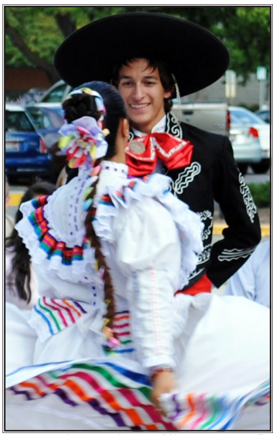
Hispanic Heritage Month