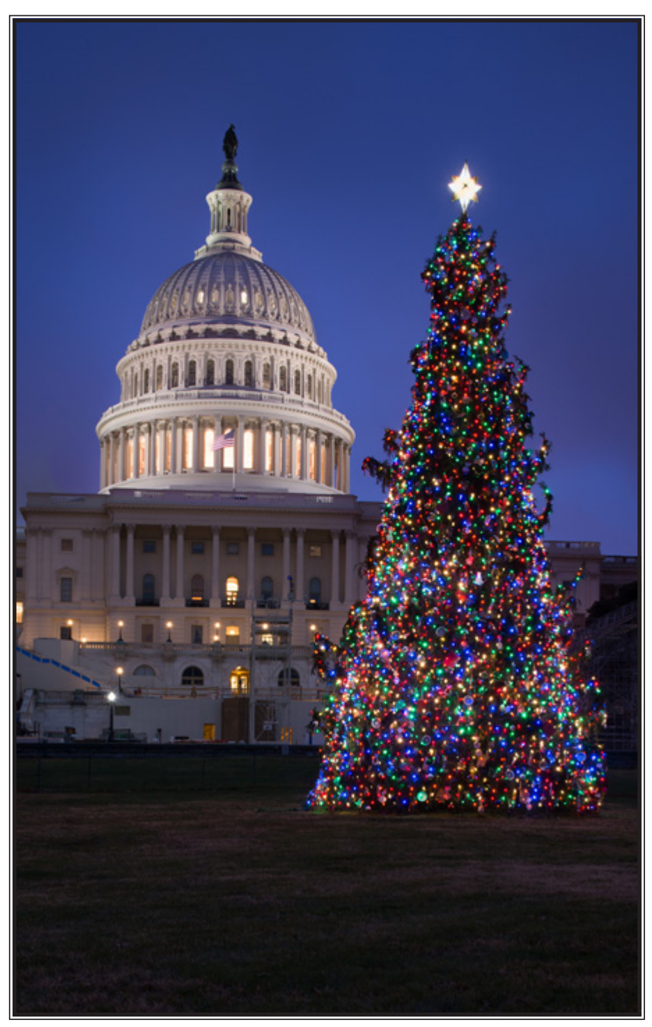
2016 U.S. Capitol Christmas Tree