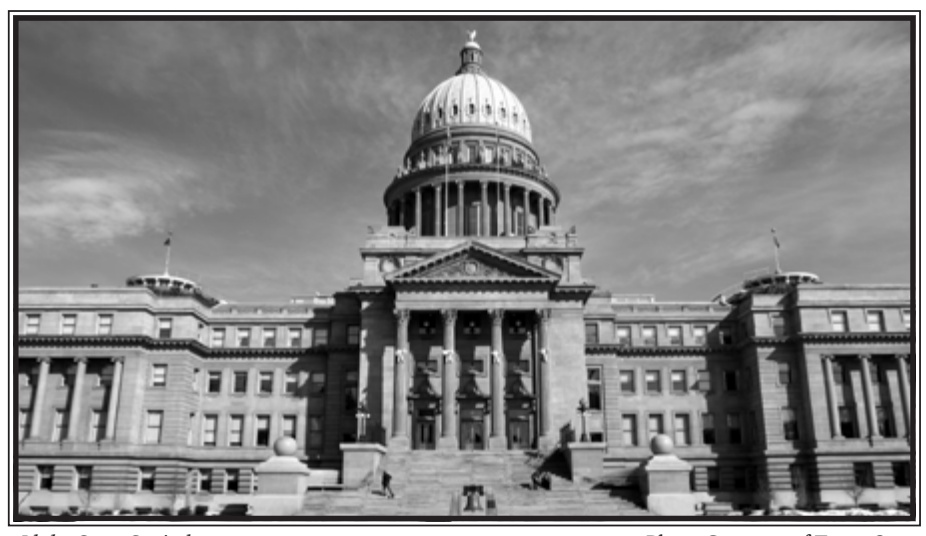
Idaho State Capitol

The underground expansion provided approximately 25,000 square feet on each side of the Capitol, larger legislative hearing rooms and opportunities to move various functions out of the Capitol Building, such as large mechanical spaces, data centers, kitchens, and dining facilities.