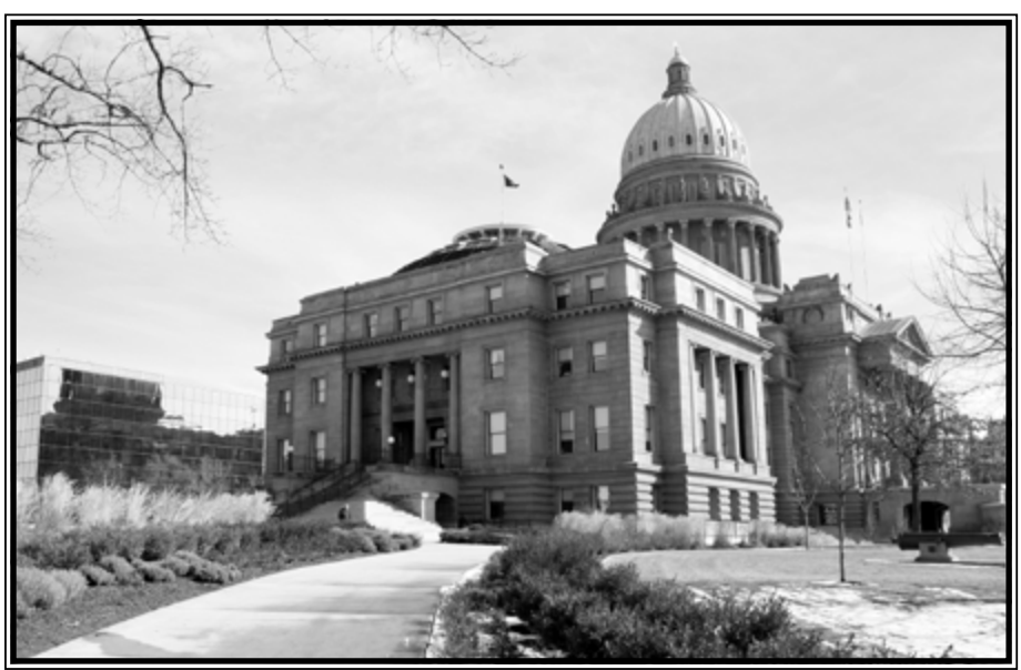
Capitol West Side

Tourtellotte was inspired to create a building that emphasized natural light and used it as a decorative element. He used light shafts, skylights, and reflective marble surfaces to capture natural sunlight and direct it to the interior space. For Tourtellotte, light was a metaphor for an enlightened and moral state government. The original design created an architecturally pleasing building that incorporated the materials and technologies of the day into a working Capitol.