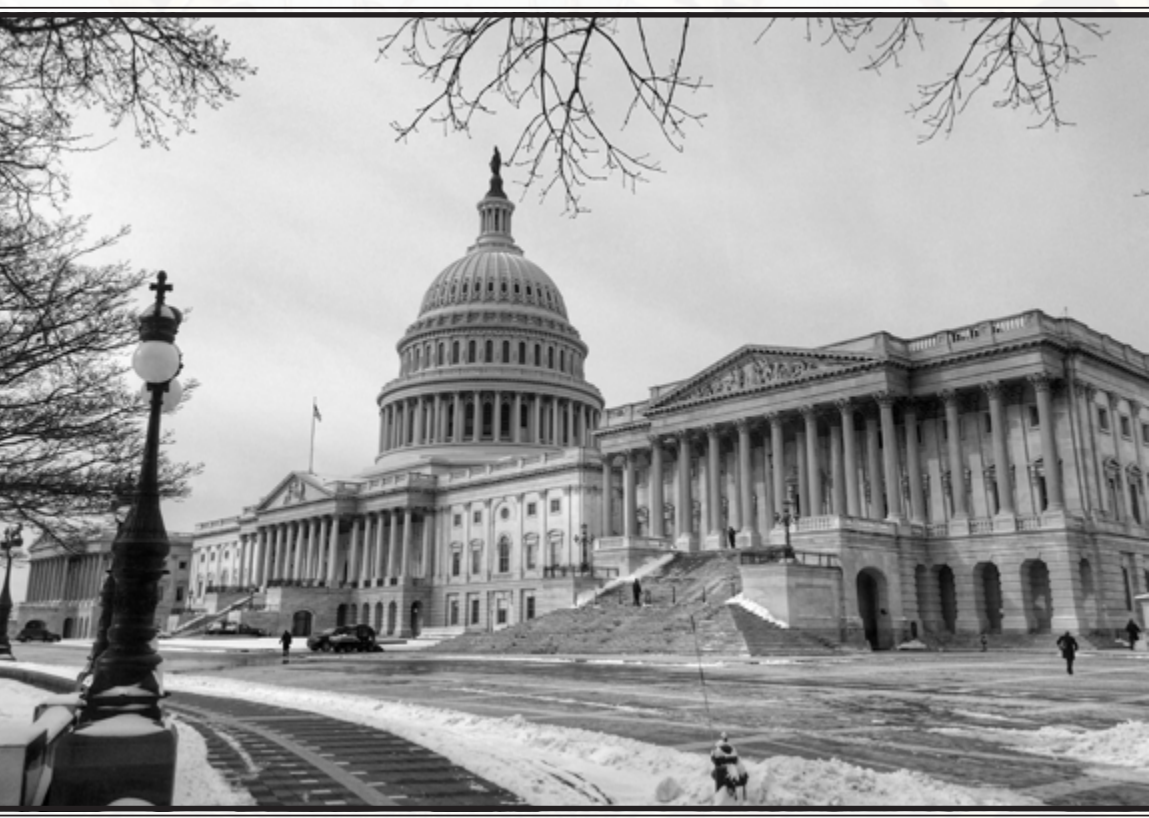
US Capitol Building