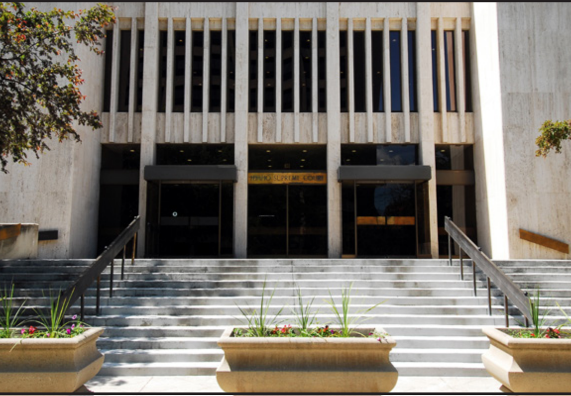
Idaho Supreme Court