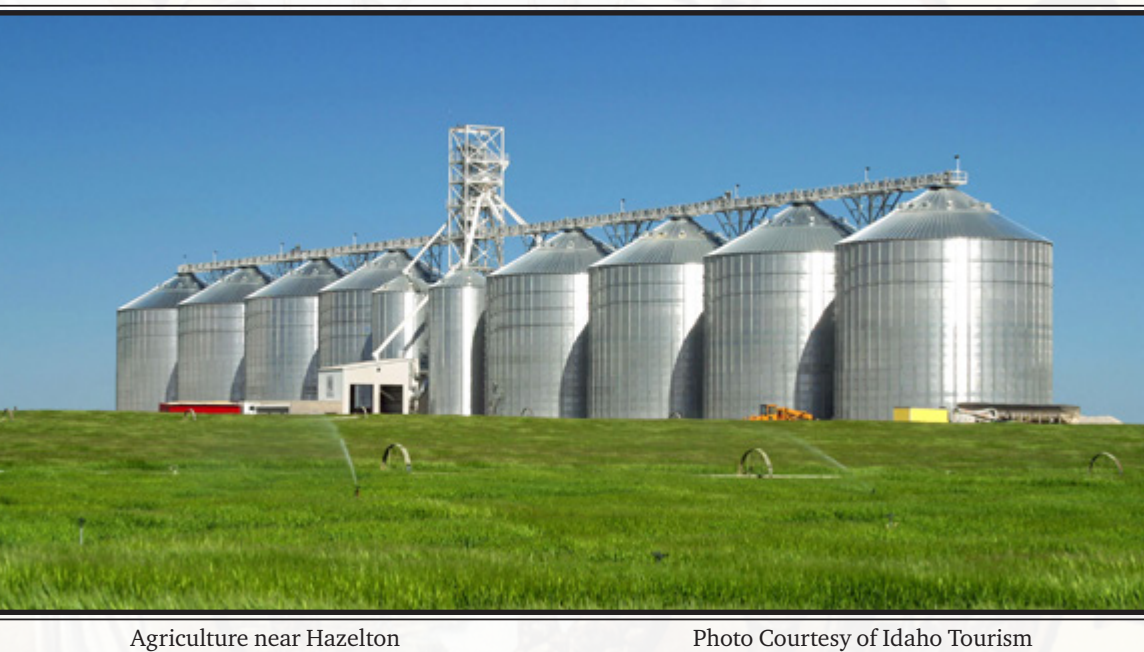
Agriculture near Hazelton