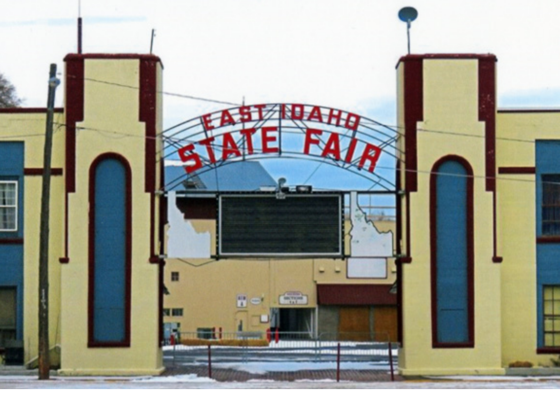
Eastern Idaho Fairgrounds