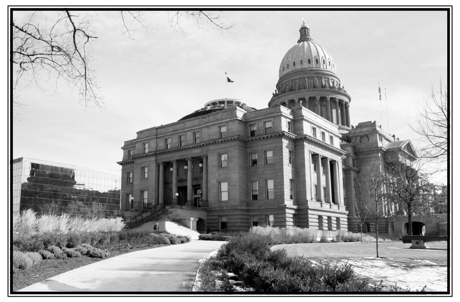
Capitol West Side

Tourtellotte was inspired to create a building that emphasized natural light and used it as a decorative element. He used light shafts, skylights, and reflective marble surfaces to capture natural sunlight and direct it to the interior space. For Tourtellotte, light was a metaphor for an enlightened and moral state government. The original design created an architecturally pleasing building that incorporated the materials and technologies of the day into a working Capitol.