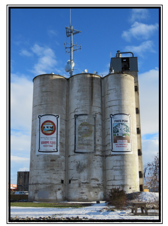
Twin Falls Milling and Elevator