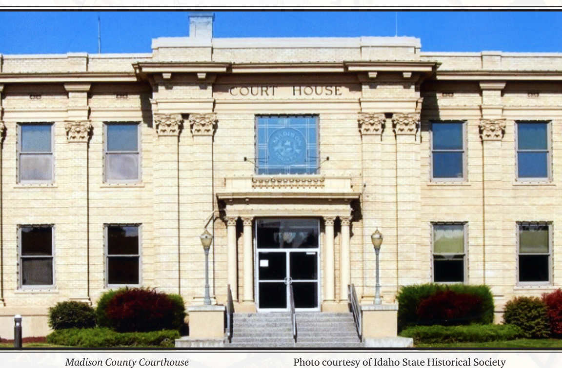
Madison County Courthouse