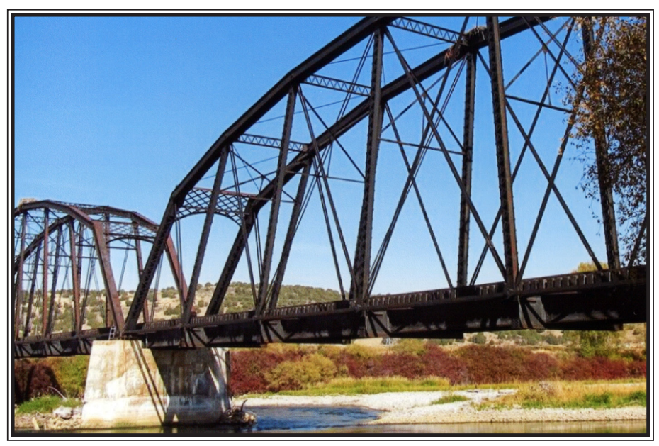
Ririe Pegram Truss Railroad Bridge