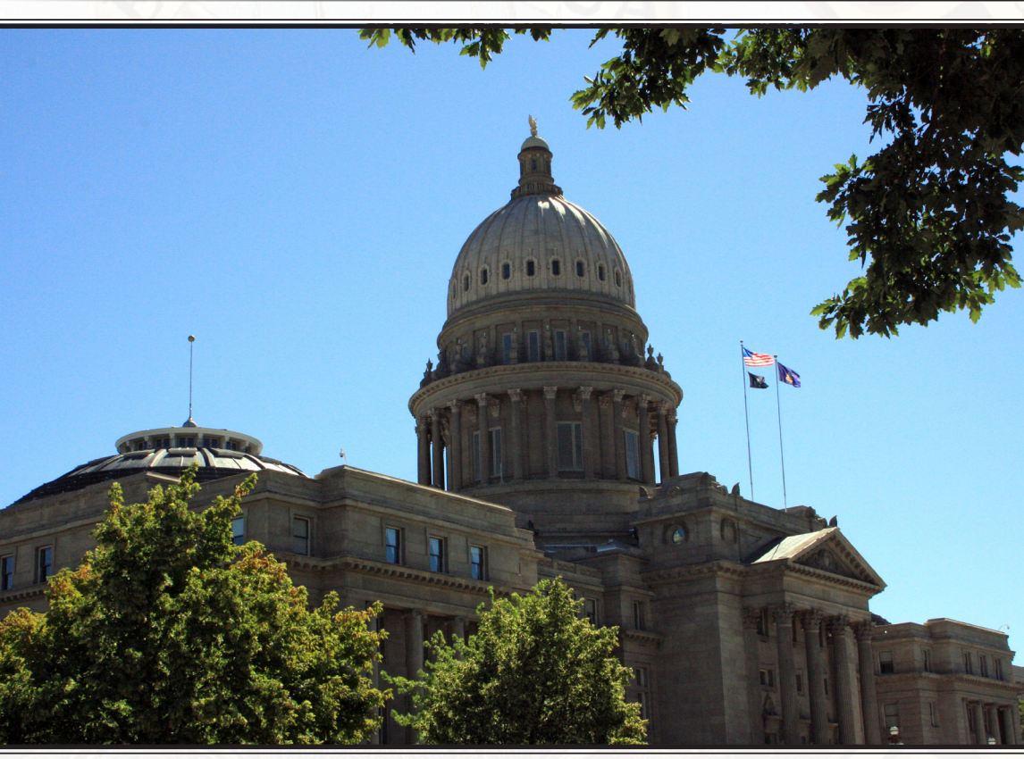
Idaho Capitol Building