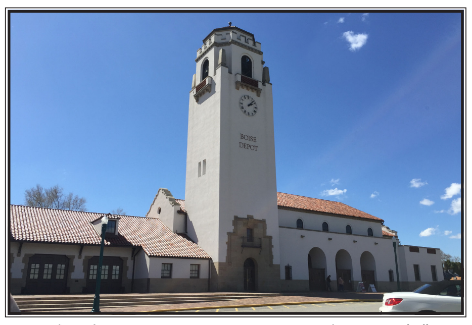
Union Pacific Mainline Depot