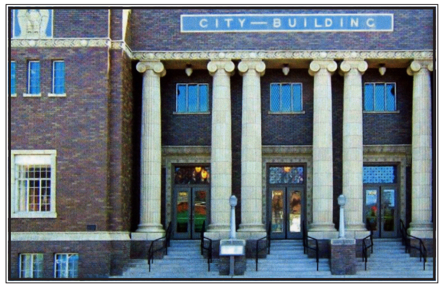
Idaho Falls City Building