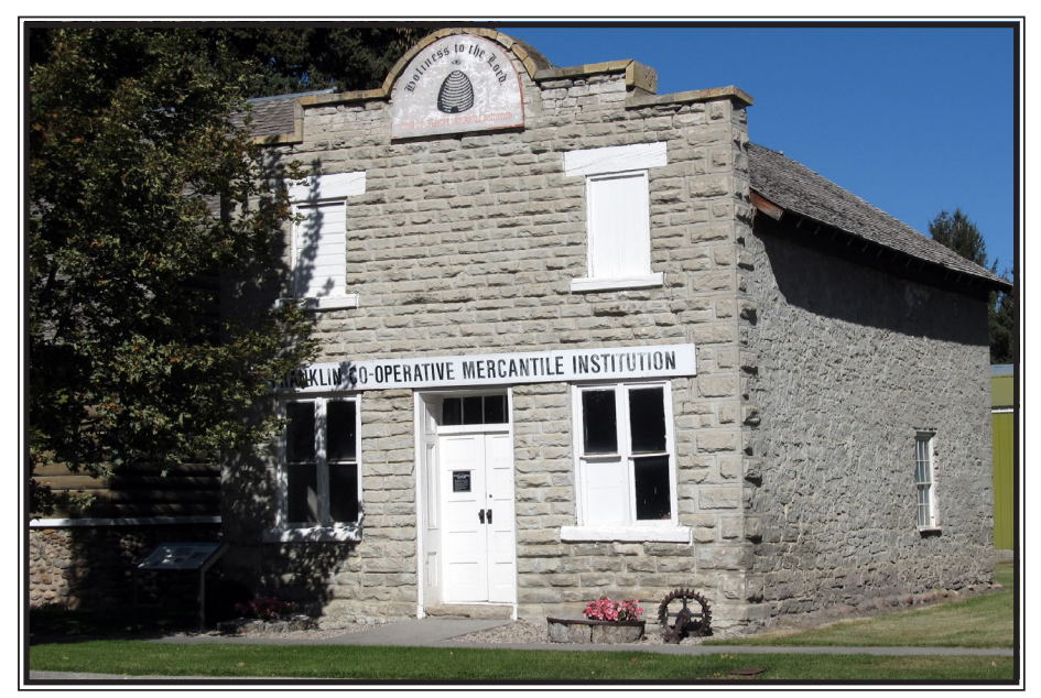
Franklin Cooperative Mercantile Institution