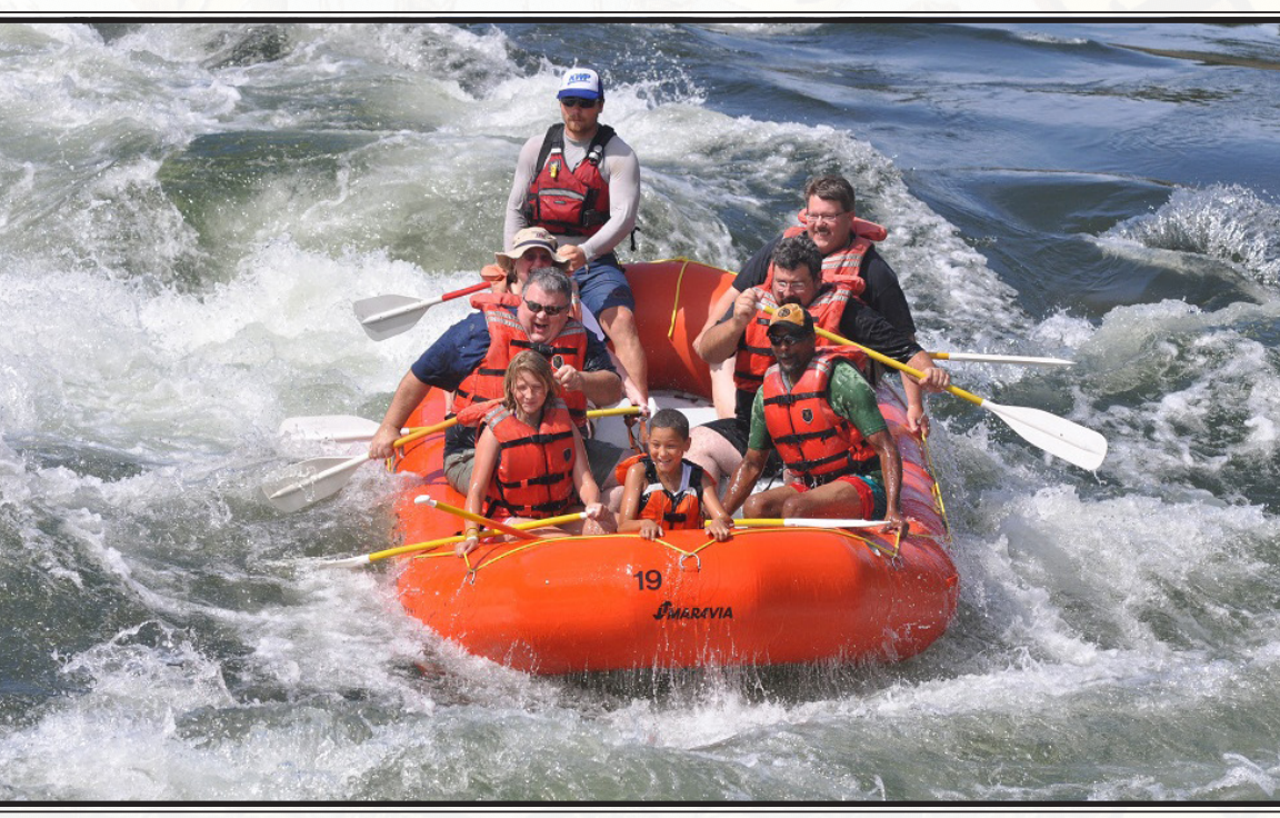
Rafting on the Payette