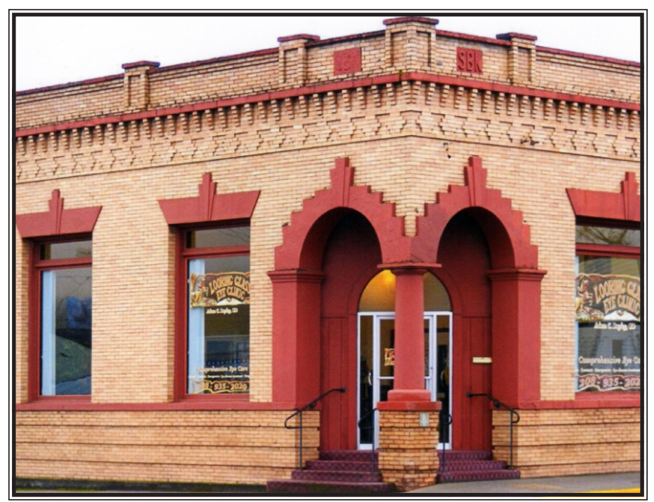
State Bank of Kamiah