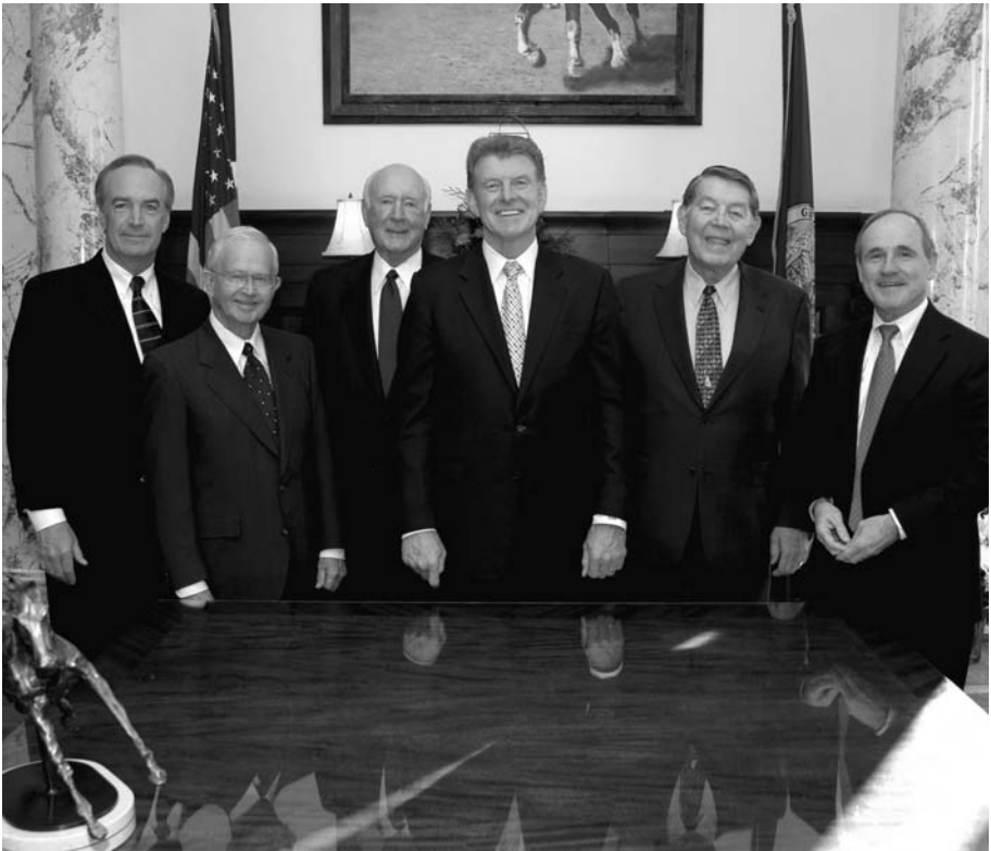
Governor C.L. "Butch" Otter (center), with former Governors Dirk Kempthorne, Phil Batt, Cecil Andrus, John Evans, and Jim Risch.