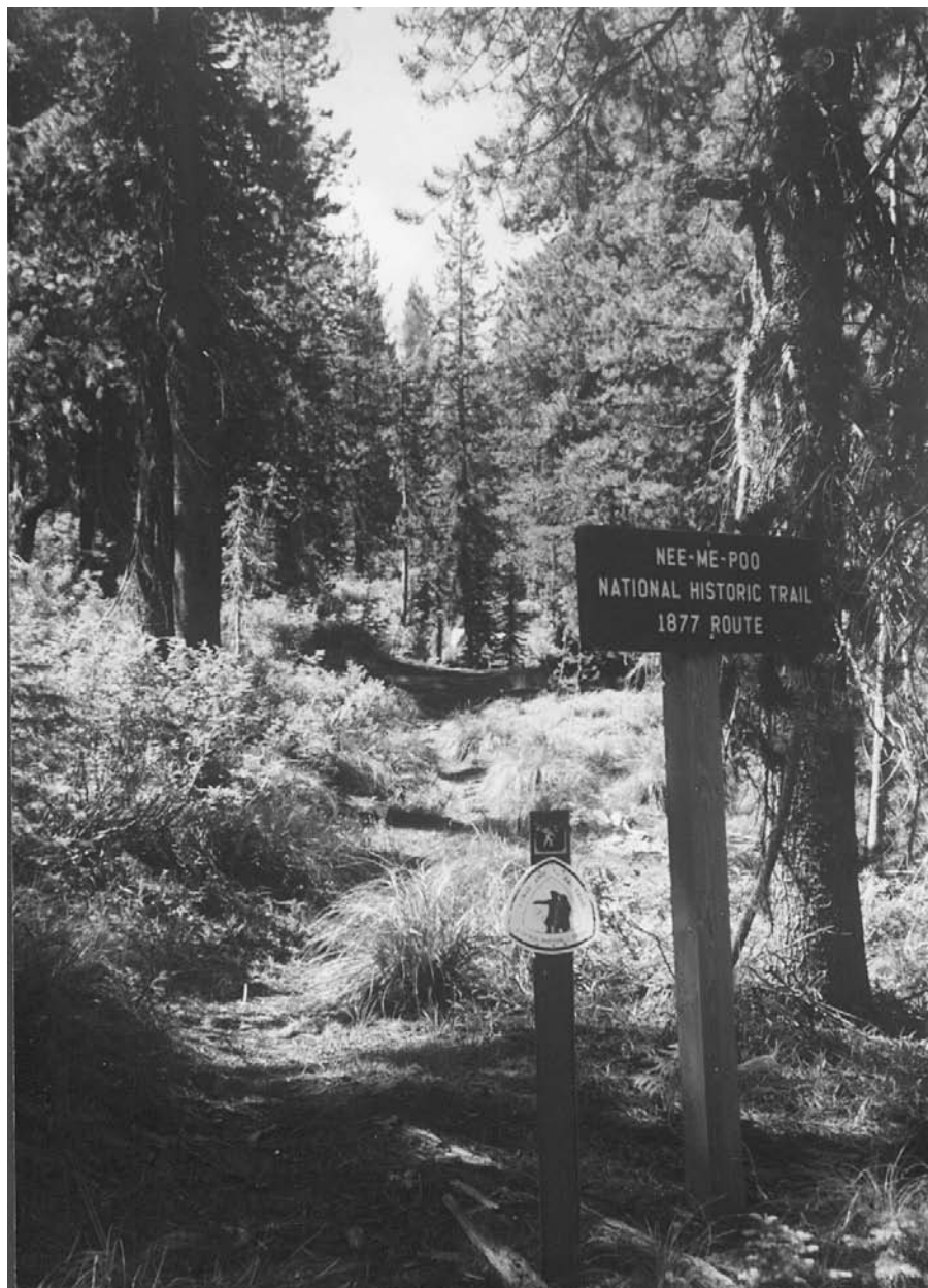
Lewis and Clark and "Nee-Mee-Poo" National Historic Trails in North Central Idaho