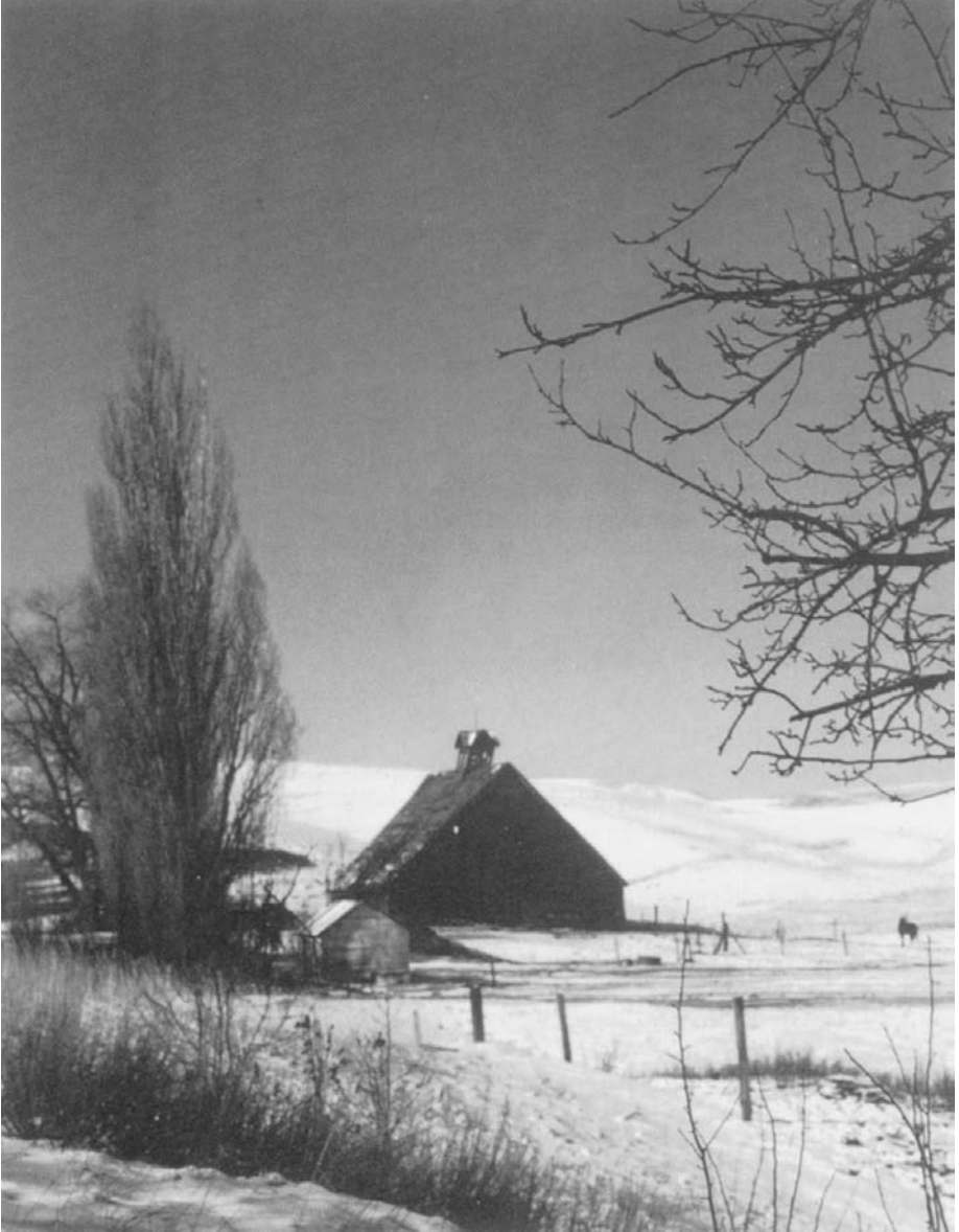
Barn near Gennesee